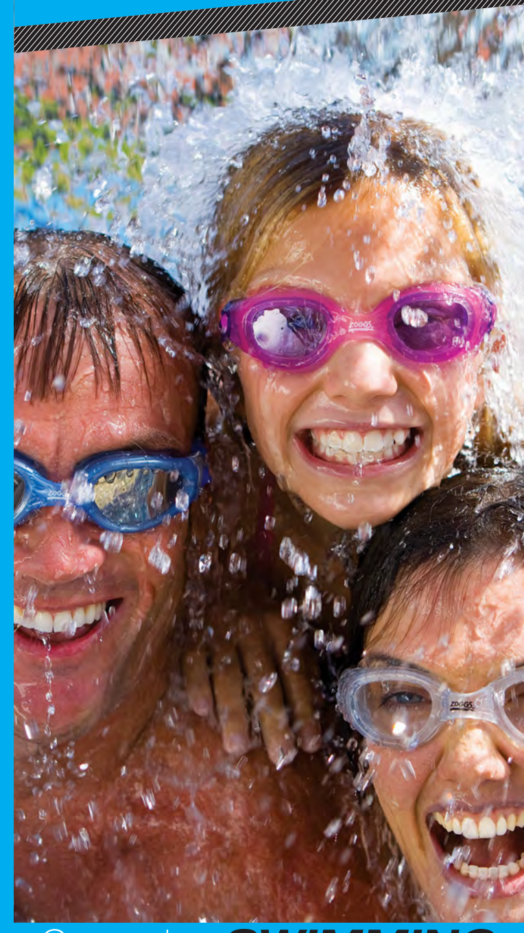
Cascades SWIMMING timetable